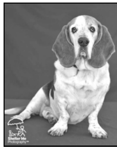
Edited by Barb & Gus

Our next food distribution: November 21st , 3-6pm