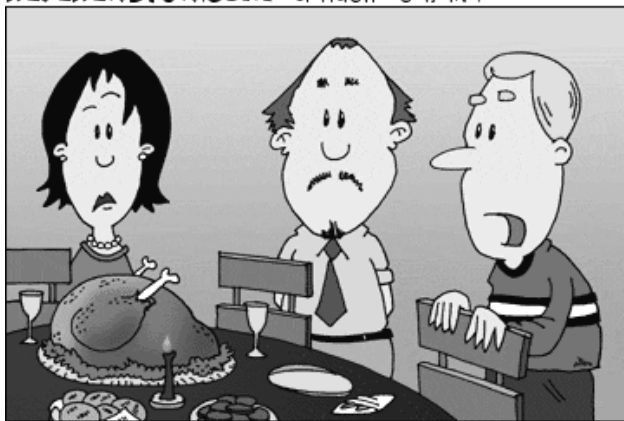
(See Psalm 100)